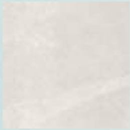
Eureka Bianco Natural