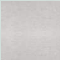
MJ Tessuti Naoki IN-FR