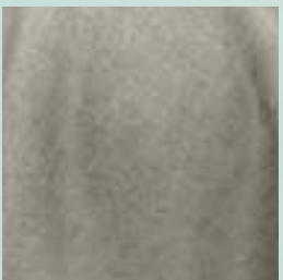
Collection Deluxe Feather Texture