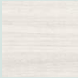
Sensi Roma White Natural