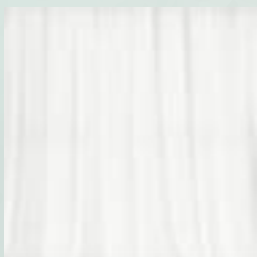
Warwick Gianna Vanilla Curtain