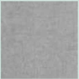
Collection Deluxe Wallpaper