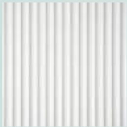
White Fluted Lacquered Wood