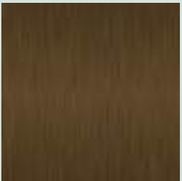
Brushed Bronze Finish